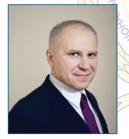
from the President of European University Sports Association

On behalf of European University Sports Association, I would like to kindheartedly greet the participants, guests and organizers of the VII International Conference "Sustainability and Legacy in Sport: Challenges and Perspectives".